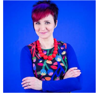
Cal Wilson Comedian/Author