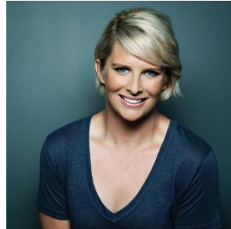
Leisel Jones Olympic Swimmer