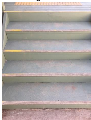
← Before Bell Blitz 2 and 3