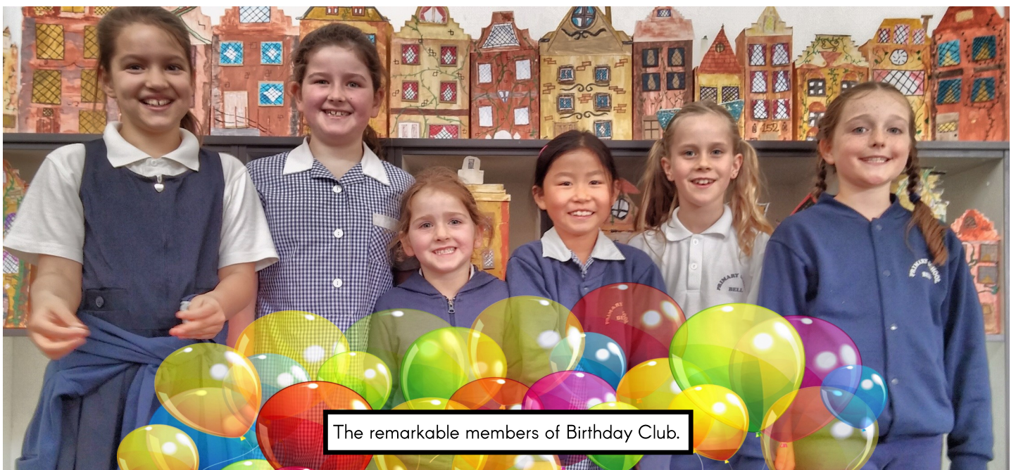
The remarkable members of Birthday Club.